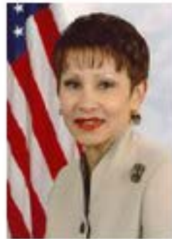
Nydia Velázquez (D-NY)