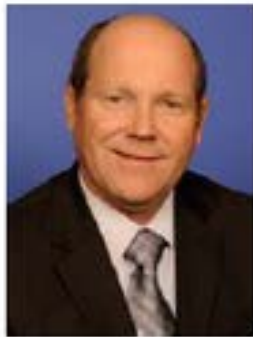
Reid Ribble (R-WI)