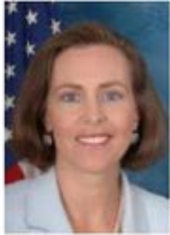
Kathy Castor (D-FL)