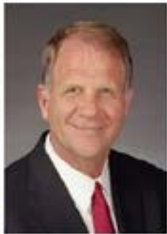
Ted Poe (R-TX)