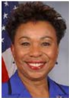
Barbara Lee (D-CA)