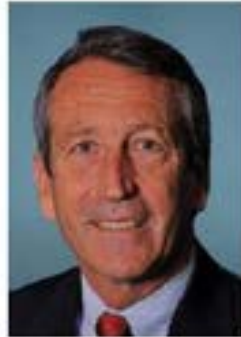
Mark Sanford (R-SC)