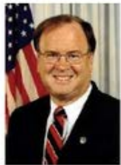
Sam Farr (D-CA)