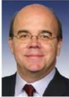
Jim McGovern (D-MA)