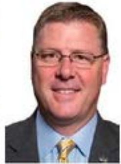
Rick Crawford (R-AR)