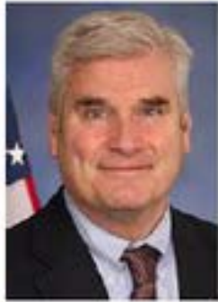
Tom Emmer (R-MN)