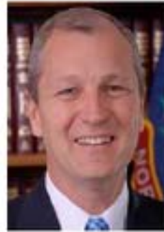
Kevin Cramer (R-ND)