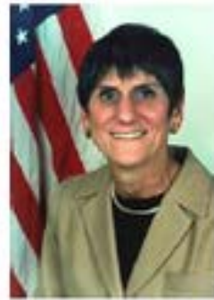
Rosa Delauro (D-CT)